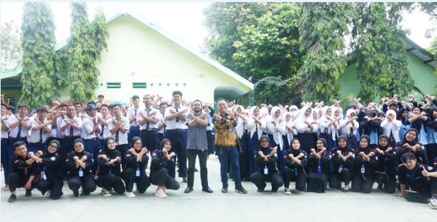
Smoke-free school campaign at Vocational High School, Hasanudin Pare, Kediri, East Java

Airlangga University and TheCenter for Tobacco Control and Health Development STRADA University organized events to involve young people in tobacco control efforts. These events aimed to raise awareness about the connections between tobacco use and health, social, and economic challenges. In Surabaya, youth that attended the forum will go on to be engaged in more tobacco control activities to build their leadership in the field. In Kediri, with the assistance of 766 primary school students, 4,000 no-smoking signs were installed.