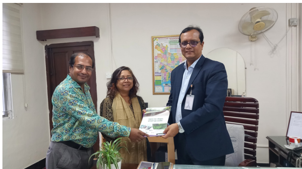
Bilateral meeting with Additional Secretary of the Cabinet Division