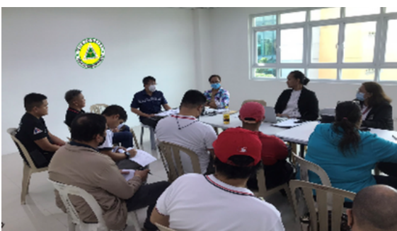
Exploratory meeting with the Quezon City Smoke-Free Task Force

On August 3, 2023, the Metropolitan Manila Development Authority (MMDA), The Union, and the World Health Organization (WHO) joined forces to host an exploratory meeting with the Quezon City Smoke-Free Task Force. The objective of this gathering was to outline a strategic response to the 2021 Global Adult Tobacco Survey findings within the city. Various enforcement departments from the Quezon City Government participated in this meeting. The main outcome emphasized the need to revise the ordinance to align it with current national laws and ensure more effective enforcement. A consultative meeting with legislators is set for September 11, 2023, and potential enforcer training is scheduled for October 4-6, 2023.