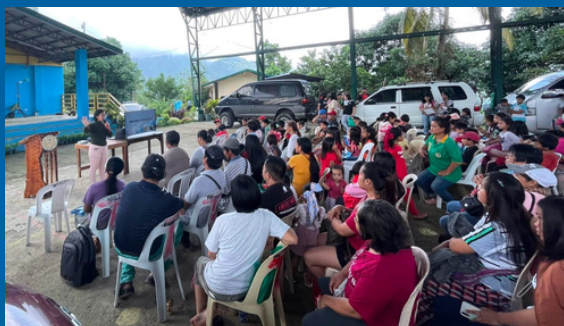
Enhanced Community Immersion Program in Benguet

The Philippine National Police Cordillera Administrative Region Training Center (PNP CARTC) recently conducted a 4-day Enhanced Community Immersion Program at San Pascual Elementary School, Tuba, Benguet. On August 8, 2023, Transcend - TICl staff joined them to address around 150 attendees, including parents, students, and police personnel. The discussion focused on the health risks associated with smoking, vaping, betel quid chewing, and the importance of upholding Tuba's Smoke-Free Ordinance. PNP-CARTC actively collaborates with Transcend and the Baguio Health Services Office to advance tobacco-free advocacy and programs in Baguio and Benguet. This partnership highlights the shared commitment to creating a healthier, smoke-free environment.