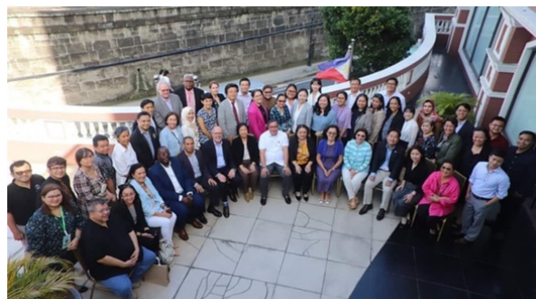
DoH's 2nd Multi-Sector Governance Council Meeting