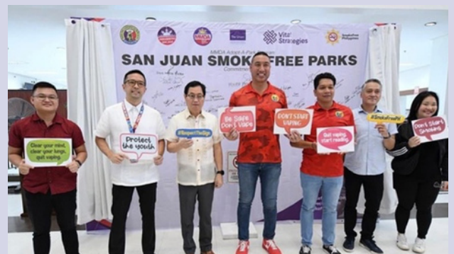
Launching of smoke-free parks in San Juan city