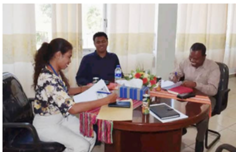
Policy meeting with Deputy Mayor of Bobonaro

In September, National Alliance of Tobacco Control Timor-Leste (ANCT-TL) conducted a meeting with the mayors of Oecusse and Bobonaro to discuss organizing a workshop on retailer compliance within their municipalities. The ANCT-TL team also sought the participation of the mayors in a site visit to local markets and retailers, aiming to identify and address any instances of tobacco promotion materials in shops, kiosks, and public spaces in alignment with their commitment to the Mayor's Declaration and the Baucau Declaration. Additionally, the meeting included discussions about the mayors' priorities for the year 2024.