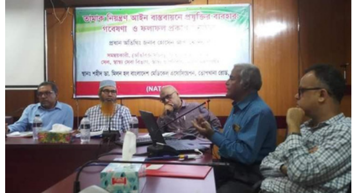
Program organized by National Anti Tuberculosis Association of Bangladesh

On September 26, 2023, National Anti Tuberculosis Association of Bangladesh (NATAB) organized a program in Dhaka titled "Use of Technology in Implementation of Tobacco Control Act: Research and Publication of Results." The event featured the Additional Secretary of the National Tobacco Control Cell, Ministry of Health and Family Welfare, as the chief guest and was attended by delegates from The Union and Bangladesh Cancer Society. The program aimed to collect data on illegal tobacco company advertising campaigns and provide it to district task force committees for law enforcement. The chief guest emphasized the importance of accurate information in enforcing the law and highlighted the government's commitment to making Bangladesh tobacco-free by 2040, aligning with SDG Goal-3 for health.