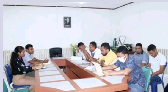
Meeting with AIFAESA inspection authority

National Alliance of Tobacco Control Timor-Leste (ANCT-TL) met with the Inspection Authority for Food and Sanitation (AIFAESA I.P) to present the results of the survey on smoke-free environments, TAPS (Tobacco Advertising, Promotion, and Sponsorship) and illicit cigarettes. During this meeting, discussions also focused on upcoming retailer workshop organized by ANCT-TL and the mayor alliance in three municipalities and future collaboration plans for 2024. AIFAESA will participate in the workshop and provide insights on inspections, including the launch of retailer compliance for 180 shops in these municipalities. Moreover, the inspection authority recommended continued support from ANCT-TL in providing evidence and coordinating multi-sector efforts.