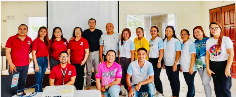
MPOWER training sessions in LGU Libacao

Smoke-Free Aklan organized training sessions with 50 participants in Local Government Unit (LGU) Malinao on the 8 August and 57 attendees in LGU Libacao on the 10th. These sessions focused on the MPOWER strategy, ordinance enforcement, and concluded with participants pledging their commitment to ensuring a smoke-free environment.