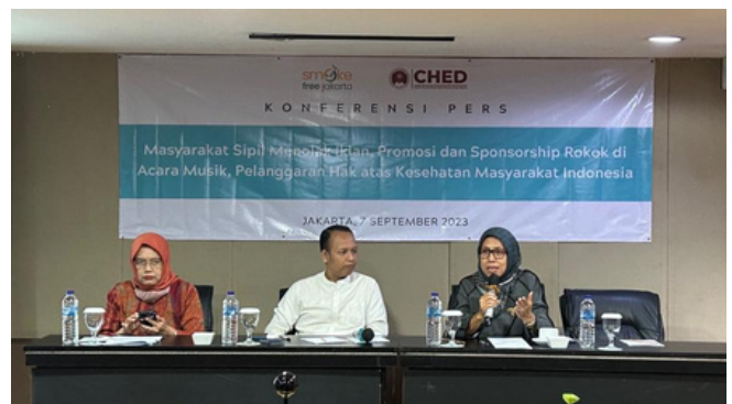
Press conference against TAPS and youth smoking initiation

On September 7, Smoke-free Jakarta, in collaboration with the Center of Human and Development (CHED), Ahmad Dahlan Institute of Technology and Business, held a press conference. The event included representatives from Smoke-free Jakarta, Raya Indonesia, the Indonesian Child Protection Agency (LPAI), and Udayana Central. At the conference, the Tobacco Control network released a statement condemning the display of tobacco advertisements at events, emphasizing its harmful impact and aiming to deter youth smoking initiation.