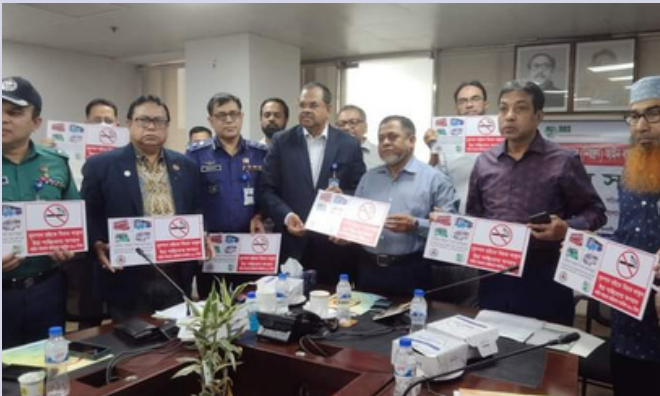
Meeting organized by Bangladesh Road Transport Authority

On September 4, 2023, the Bangladesh Road Transport Authority (BRTA) held a discussion meeting in collaboration with Development Activities of Society (DAS) and the Bangladesh Anti-Tobacco Alliance (BATA). BRTA affirmed its dedication to enforcing smoke-free regulations in public places and public transport through measures such as mobile courts. The meeting, chaired by BRTA Chairman Noor Mohammad Majumdar and attended by key officials, aimed to enhance public health and advance the cause of a tobacco-free Bangladesh. During the session, The Union presented a concept paper and strategies were discussed under the guidance of notable figures in attendance.