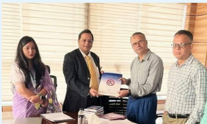
Meeting with Vice Chairman of the Bangladesh Film Censor Board