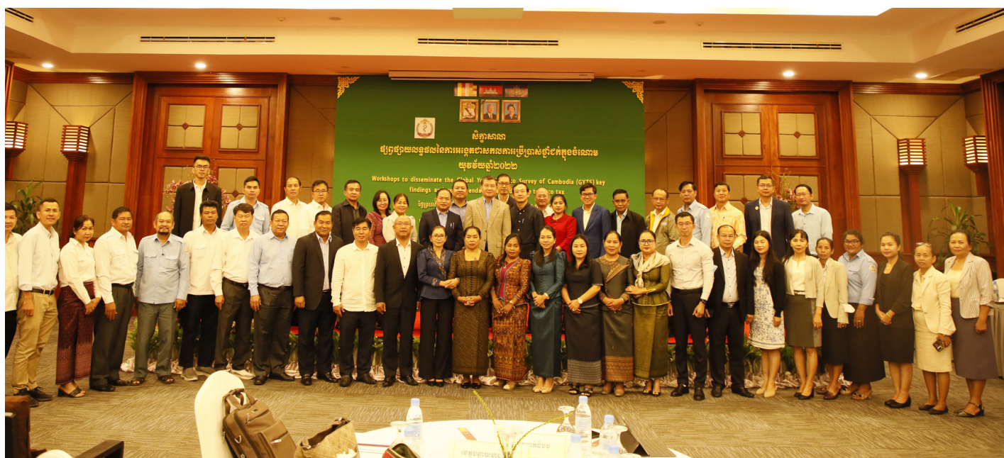
Dissemination workshop on GYTS in Siem Reap

In September, two dissemination workshop were conducted in Phnom Penh and Siem Reap, focusing on the findings of the Global Youth Tobacco Survey (GYTS). These workshop engaged total 143 participants ( 85 in Phnom Penh and 58 in Siem Reap), including government representatives from various Cambodian ministries, provincial health departments, and WHO officials. The survey, conducted in collaboration with the Ministry of Health and the Department of Education, Youth, and Sports, involved 34 schools across Cambodia. The 2022 survey results highlighted a low prevalence of tobacco use among Cambodian youths in this age group, with a national rate of 3.5%, 4.4% among boys, and 2.8% among girls, which is the lowest prevalence of tobacco use among ASEAN countries . The survey also noted a decrease in secondhand smoke exposure in public places and a decline in tobacco industry advertising targeting youth. However, emerging concerns included the use of new tobacco products such as e-cigarettes and heated tobacco products (HTPs) among youths. During the workshop, the participants requested more training on new tobacco products' effects, additional prevention measures, and evaluation for smoke-free city status, similar to Kampot. Officials from Kep province requested for quicker fine processing for tobacco and alcohol violations.