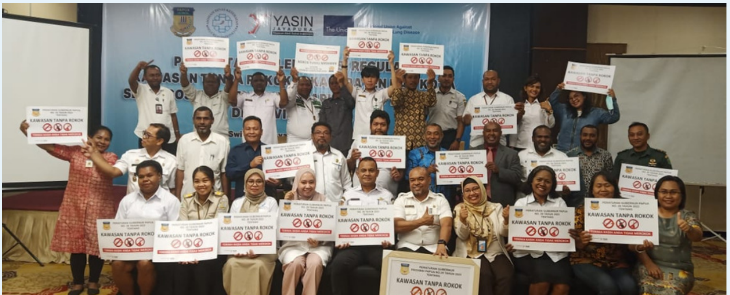
Capacity building training on implementation of the new smoke-free policies

The Papua Provincial Government in Indonesia has passed a groundbreaking regulation (Regulation No. 29 of 2023) mandating comprehensive smoke-free policies in public places, workplaces, and public transportation, including a ban on e-cigarettes and all forms of tobacco. This regulation also prohibits tobacco advertising, promotion, sponsorship, and the display of tobacco products at the point of sale throughout the entire province. Papua Province, with a population of approximately 3.4 million residents, spans nine regencies and cities, and this regulation requires prompt implementation at the local level within these districts and cities. The success of this achievement is attributed to collaborative efforts by organizations such as The Union, Yassin Jayapura, Asia Pacific Cities Alliance for Health and Development (APCAT), Association of All Health Offices Indonesia (ADINKES), Ministry of Health and Ministry of Home Affairs, which have provided support and assistance since 2020. The successful outcome underscores the effectiveness of a cooperative approach and the dedication of regional and local leaders. A training for 53 government officials was also held to build capacity on implementation of the new policy.