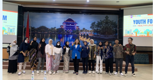
Youth Forum on Healthy Lifestyles organized at Airlangga University, Surabaya