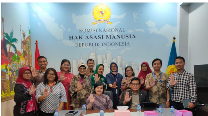
Meeting with the National Commission of Human Rights

The Union's grantee, Rumah Mediasi Indonesia (RMI) in collaboration with the tobacco control network met with the leadership of the National Commission of Human Rights (KOMNAS HAM) with the objective of engaging the agency in the overall tobacco control discussion. KOMNAS HAM has agreed to lead to build the capacity of human rights groups across Indonesia in Tobacco control.