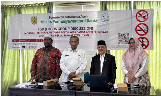
FGD with the Council of Muslim Consultative Assembly

discussed successful local smoke-free implementations (including bans on tobacco advertising, promotion and sponsorship - TAPS) in various Indonesian regions, emphasizing their benefits for tobacco farmers. The law is set to be signed this year, with ongoing efforts to finalize the draft, incorporating bans on TAPS and point-of-sale display.