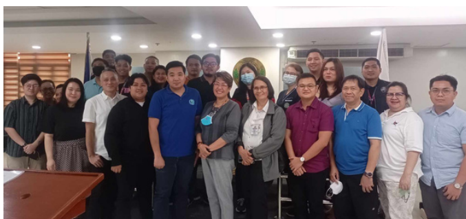
Awareness raising workshop on E-cigarettes, focusing on youth

Metro Manila Development Authority (MMDA) organized two orientation and communication planning workshops for Metro Manila LGUs' Sangguniang Kabataan Federation on July 11 and 18. These workshops aimed to raise awareness among youth about the risks of electronic cigarettes and involve them in tobacco control advocacy. The initiative was a collaborative effort with various organizations, including the Department of Interior and Local Government, National Youth Commission, The Union, Vital Strategies, Action on Smoking and Health Philippines, and Metro Manila LGUs.