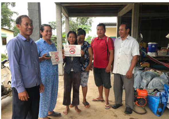
House-to-House Meetings with Villagers and Target Groups in Pursat

A meeting with the Under Secretary of the Ministry of Health and Population (MoHP) was held to address the appropriate usage of health tax funds, the effective implementation of a 90% pictorial health warning (PHW) on imported tobacco products, and enforcing tobacco control laws. The Under Secretary committed to ensuring proper use of health tax revenue, partnering with stakeholders for the 90% PHW implementation, and strengthening tobacco control law enforcement. The meeting showcased his willingness to collaborate with diverse stakeholders to ensure the success of these initiatives. It involved six participants, including members of the Action Nepal team and Health Journalist.