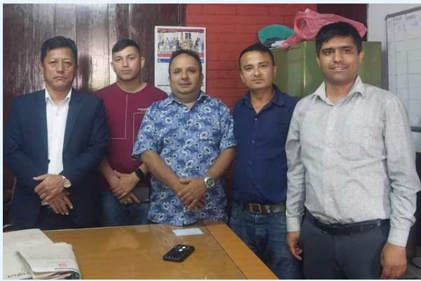
Meeting with Under Secretary of the Ministry of Health and Population