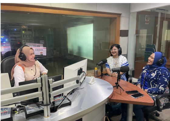
LPAI Radio broadcasting activity on Radio Republik Indonesia

Indonesian Child Protection Agency (LPAI), in partnership with Indonesian Tobacco Control Network (ITCN) and various community organizations beyond the TC Network, has reinforced its efforts to protect children from the hazards of tobacco by broadcasting regular sessions on Radio Republik Indonesia (RRI). This month's discussion focused on guiding families in setting up smoke-free homes and choosing to be healthy without tobacco.