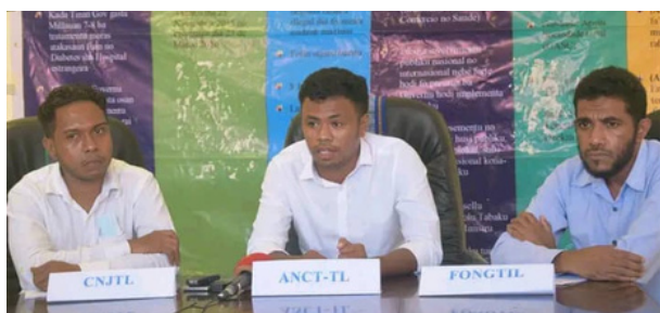
Press conference on investigating illicit cigarettes

On August 15, The Union's grantee, ANCT-TL held a press conference with the aim of urging the government to take action regarding illicit cigarettes. Specifically, they called upon the Port authority and the Police to conduct investigations into corrupt practices at the border, including those involving retailers engaged in smuggling activities. The press conference was attended by 10 local media outlets. ANCT's initiative sought to shed light on the pressing issue of illicit cigarettes and the need for stringent measures to combat their distribution and associated corrupt practices at the border.