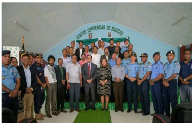
High-level meeting at Baucau Municipality

On August 28-29, the Mayor Alliance for Health and Development in Timor-Leste (APAS), in collaboration with the Ministry of Health and the World Health Organization (WHO), organized a two-day high-level meeting in Baucau Municipality. The objective was to raise awareness among local leaders about tobacco laws. The meeting concluded with the "Baucau Declaration," outlining three main agendas for 2023-2024: promoting smoke-free public places, prohibiting tobacco promotion, sponsorship, and advertising, and banning illicit cigarettes. The Mayor of Baucau, representing the Chair of the Mayor Alliance, emphasized their commitment to tobacco control programs for a smoke-free future. The meeting had 144 participants, including law enforcement authorities, education directors, presidents of municipalities, WHO representatives, health and public affairs officials, National Alliance of Tobacco Control Timor-Leste (ANCT-TL) and the media.