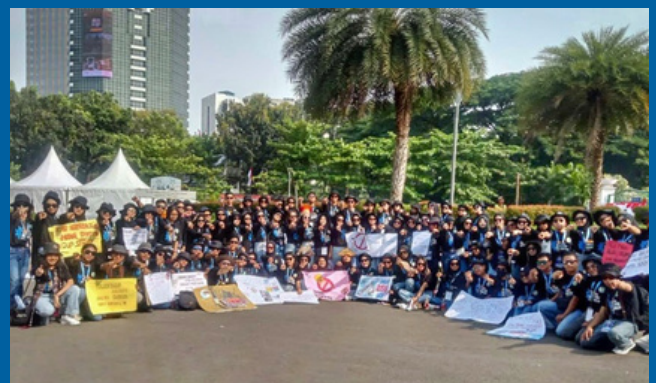
Youths advocating for smoke-free beach and public places

ASPEKSINDO, the association of the regional governments of coastal and island areas, conducted the Youth Movement called "Duta Maritim". The youth ambassadors stand up for the creating smoke-free beaches and promotes a smoke-free lifestyle for youngsters. To celebrate the Indonesian Independent Day, they got support from the Minister of Tourism and Creative Economy, Mr Sandiaga Uno, who emphasized the importance of a smoke-free environment, especially in the tourism area.