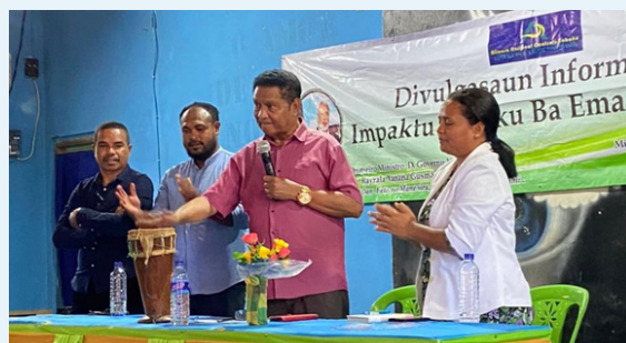
Mayor of Baucau Municipality giving speech at the campaign

On August 21, the Mayors of Baucau and Ermera, in collaboration with the Ministry of Youths and Sports and the ANCT-TL, organized a campaign targeting hundreds of youths, teachers, and directors at the municipal level. The purpose of the campaign was to raise awareness about the dangers of tobacco and educate them about tobacco control laws. The mayors emphasized their commitment as members of the Mayor Alliance to promote a smoke-free future, with the goal of reducing non-communicable diseases in their respective municipalities. In total, 180 participants took part in the "Campaign on the Tobacco Hazard."