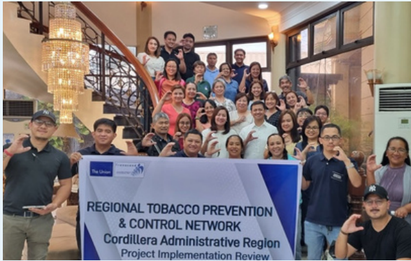
Snapshot from Project Implementation Review Workshop