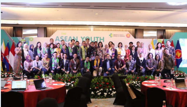
ASEAN Youth Workshop on Tobacco Control

The Union and PP IPM actively participated in the ASEAN Youth Workshop on Tobacco Control, co-hosted by ASEAN and the Ministry of Health. This collaborative event aimed to raise awareness about the dangers of tobacco consumption among youth in the ASEAN region and promote tobacco control campaigns. The workshop took place from August 23 to 27 in Jakarta and also served to support Indonesia as the Chair of ASEAN 2023 under the theme "ASEAN Matters: Epicentrum of Growth". Additionally, the event included ASEAN Car Free Day on its last day, attended by Minister of Health Budi Gunadi Sadikin and other health ministry representatives, promoting healthy lifestyles through physical and community activities during a traffic-free period.