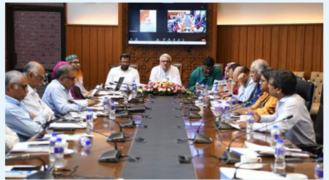
Participants of round table meeting titled "E-Cigarette: Myth and Reality"

The Tobacco Control and Research Cell (TCRC) of Dhaka International University organized a round table meeting titled "E-Cigarette: Myth and Reality" on August 20. The event brought together parliamentarians, former health minister, delegates from the police force and the National Tobacco Control Cell, along with tobacco control and public health experts. Chief Guest MP Md. Shamsul Haque Tuku highlighted the right to health and emphasized the health risks associated with all tobacco products, including e-cigarettes. He stressed that e-cigarettes cannot be a substitute for smoking cessation and urged the Ministry of Commerce to prohibit e-cigarette imports, aiming for a tobacco and e-cigarette-free Bangladesh.