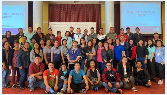
Newly appointed smoke-free enforcers from Baguio City

A force of 80 dedicated volunteers, representing different barangays, private organizations, and public institutions, were officially appointed as enforcers of the Baguio City Smoke-Free Ordinance during an intensive two-day training on June 29-30, 2023. These enforcers were educated on the WHO MPOWER strategy, embracing its six impactful measures to effectively combat tobacco demand.