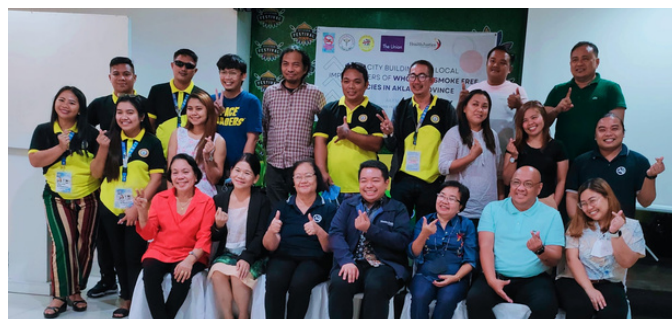
Capacity Building workshop on WHO FCTC Smoke-Free Policies

MMDA (Metropolitan Manila Development Authority) personnel inspected the vicinity of 113 schools and 26 public transportation terminals in the region to assess the sale of tobacco/vapor products, compliance with TAPS regulations, and proper display of No Smoking signage. A total of 1,183 violations were reported to the respective Local Government Units for verification and appropriate action.