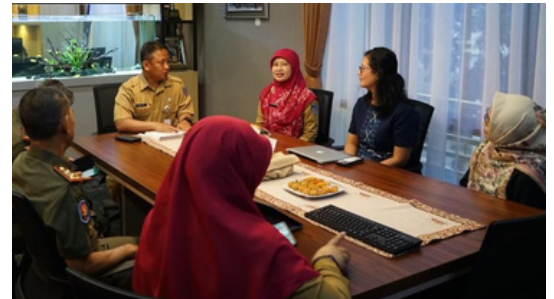
High level meeting with the Depok City Secretary

Jakarta: A new feature allowing the public to report violations of smoke-free regulations is now available on the JAKI app, a platform administered by the Jakarta provincial government. This development is the outcome of collaboration between Smoke-free Jakarta and Jakarta Smart City in Jakarta Provincial Government.