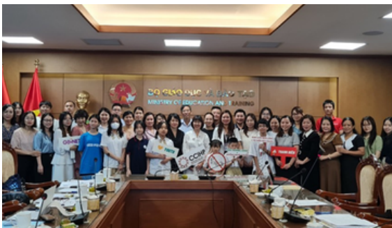
Dialogue on Smoke-Free Educational Institutions in Vietnam

On August 5, 2023, Center for Creative Initiatives in Health and Population (CCIHP) in collaboration with Department of Teachers and Education Managers organized a dialogue between Ministry of Education Training (MOET) representatives and schools, parents and children on smoke-free school. The objectives included sharing information on current tobacco use in educational institutions, addressing implementation challenges, and defining collaborative roles among stakeholders. Around 50 participants attended, including officials from various ministries, teachers, students, and child-focused NGOs, providing input on better implementation of tobacco control laws and smoke-free school efforts by MOET.