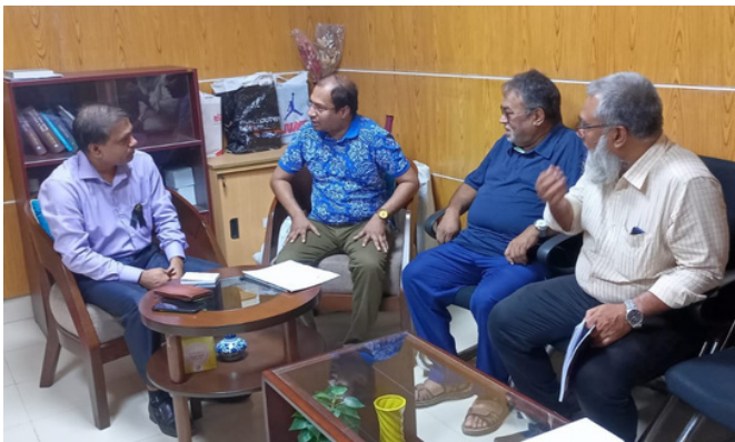
Meeting with DDLG, Dhaka