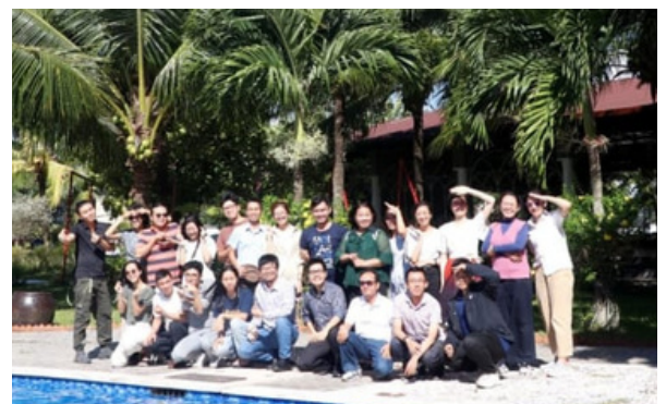
Participants of training workshop on tobacco tax and justice

Center for Education Promotion and Empowerment of Women (CEPEW) and the Tax Justice Alliance organized a two-day training workshop on tobacco tax and justice in Vietnam. The workshop, attended by 25 participants, aimed to provide evidence for tobacco tax reform in the country. It also served as a platform for connecting people and organizations interested in this reform and facilitated discussions between young participants and experts in the field. The overall objective was to raise awareness and deepen understanding of tobacco-related issues in Vietnam.