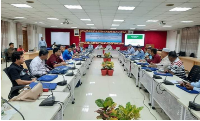
Workshop hosted by NILG for capacity building of mayors and officials