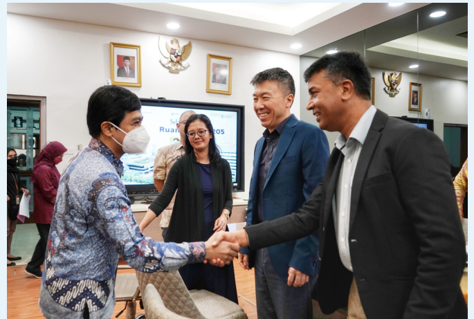
Meeting with Vice-Minister of Health, Indonesia

The MOH is currently in the process of adopting government regulations derived from the omnibus law, keeping tobacco control as a top priority. Moreover, The Union reaffirmed its commitment to collaborating with and supporting the Ministry of Health in integrating TB and tobacco control efforts in Indonesia.