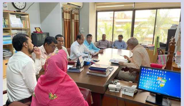
Meeting with Rajshahi City Corporation team

On August 20, 2023, the AID Foundation conducted a meeting with the Chief Executive Officer of Rajshahi City Corporation and his team to discuss the LGI guideline implementation progress for Tobacco Control. The Focal Point provided updates, noting that the licensing process will start with the new mayor and a dedicated budget has been allocated for tobacco control activities. The Chief Executive Officer expressed confidence in making Rajshahi a tobacco-free city under the Clean City initiative.