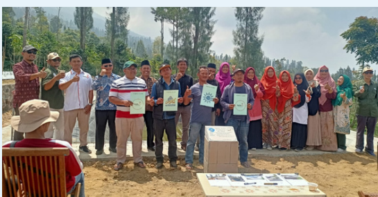
Launching of micro reservoir for crop diversification

Tobacco farmers in Kledung, Temanggung Regency, received the support from Muhammadiyah Tobacco Control Center, University of Muhammadiyah Magelang and Muhammadiyah Central Java to build water reservoir. This project benefits five farmer groups, consisting of around 150 households, and 500 residents. Located on Mount Sindoro's slopes, it tackles dry-season irrigation challenges of the farmers, who have been shifted from tobacco plantation to more profitable crops like chilies, vegetables, corn and coffee. This initiative is a solution for farmers to diversify their crops and gain more profits, without depending on tobacco.