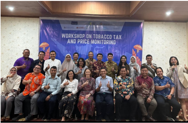
Participants of workshop on tobacco tax & price monitoring

A two-day workshop on tobacco tax and price monitoring was held in Bali, Indonesia, with 27 participants. The primary objectives of the workshop were to develop advanced data analysis techniques, generate comprehensive reports, and devise strategies for effectively using and sharing price monitoring data with policymakers and stakeholders. The Union team discussed the protocol and results of price monitoring of tobacco products in the past years.