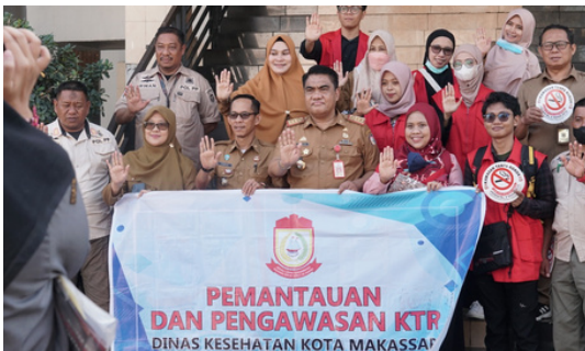
Random inspection led by Makassar Mayor Assistant

Makassar: Makassar Mayor Assistant led the random inspection during this month of 17 venues, including workplaces, restaurants, cafes, and shopping malls, which was covered by various printed and online media. Additionally, The Union, in collaboration with the city government and Hasanuddin Contact, organized training for 34 Civil Police officers from 14 subdistricts on August 2nd to enhance their technical skills for better enforcement.