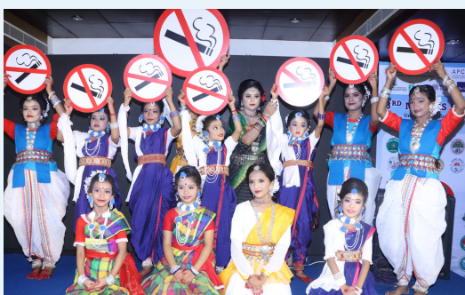
No Smoking Performance initiated by youths

During the opening session, esteemed guests from diverse health organizations underscored the pivotal role of mayors in managing public health issues. On the second day, 35 mayors from the Asia Pacific region participated, engaging in keynote speeches and discussions concerning leadership, accountability, and sustainability in safeguarding public health.