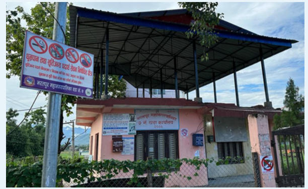
Posting "No Smoking" signages in public places of Bharatpur Metropolitan

Ward 7 authorities in Bharatpur Metropolitan have designated all public places, educational institutions, and government buildings as smoke-free zones. They've installed 50 "No Smoking" signs in places like government buildings, public spaces, and more. Offenders will be penalized as per tobacco control laws. The authorities are committed to maintaining these smoke-free zones through enforcement, awareness campaigns, and collaborations with stakeholders, including community, civil society, and non-governmental organizations, to create a healthier and cleaner environment for residents.