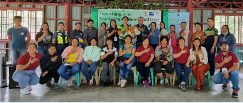
Participants at Launching of Tobacco-Free Tourism Sites in Kabayan

On 16 June, the Kabayan Municipal Health and Tourism Offices, along with Transcend, organized the Launching of Smoke, Vape, and Betel Quid-Free Tourism Sites in Kabayan, Benguet. Coinciding with No Smoking Month, the event involved municipal officials, employees, tourist guides, and reporters. During the event, the Smoke-Free Municipal Ordinance No. 168 s. 2020 of Kabayan was highlighted, emphasizing the significance of safeguarding the health of people and the environment in tourist sites by declaring them free from smoking, vaping, and betel quid chewing. In an official announcement, the seven wonders of Kabayan, including Mt. Pulag and Four Lakes, were designated as tobacco-free areas.