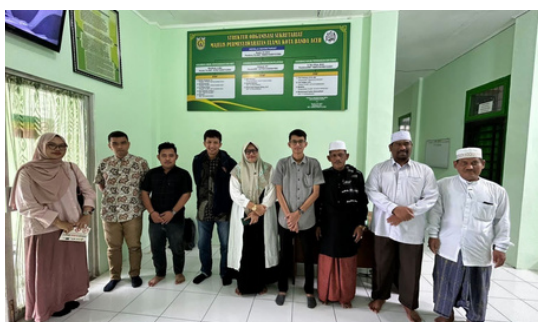
Meeting with the Council of Muslim Consultative Assembly

Aceh: The Union grantee, Aceh Institute, met with the Council of Muslim Consultative Assembly (MPU) on 11 July, seeking support for the issuance of an MPU circular letter to enforce smoke-free regulations in Aceh. The circular letter, backed by MPU's previous edict declaring smoking as haram, aims to strengthen smoke-free implementation in the city. Meanwhile, 23 Banda Aceh inspectors checked 46 venues, issuing warning letters to 13 non-compliant ones.