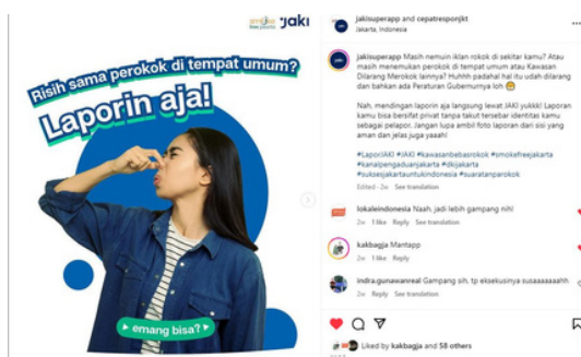
Social media campaign on Instagram

Jakarta: The Union grantee, Smoke-free Jakarta, re-assessed 294 locations in July to check for violations of tobacco advertising rules. This follows an earlier round of monitoring 6-8 months ago, with a total of 1,000 places to be reviewed. A detailed report will be available by end of August. A joint social media campaign with @jakisuperapp on Instagram started on July 5 th , encouraging reporting of violations through the JAKI app. The Instagram account @jakisuperapp is managed by Jakarta Smart City, one of Jakarta's public service agencies.