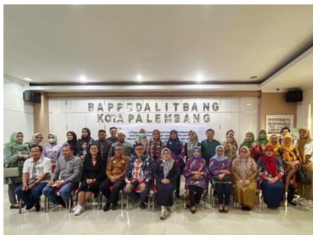
Interdepartmental meeting on smoke-free implementation in Palembang

Palembang: On 7 July, 2023, an interdepartmental meeting was convened by the Acting City Secretary and the Head of the Planning Bureau, along with the smoke-free task force, to provide support for the implementation of smoke-free policies in the city.