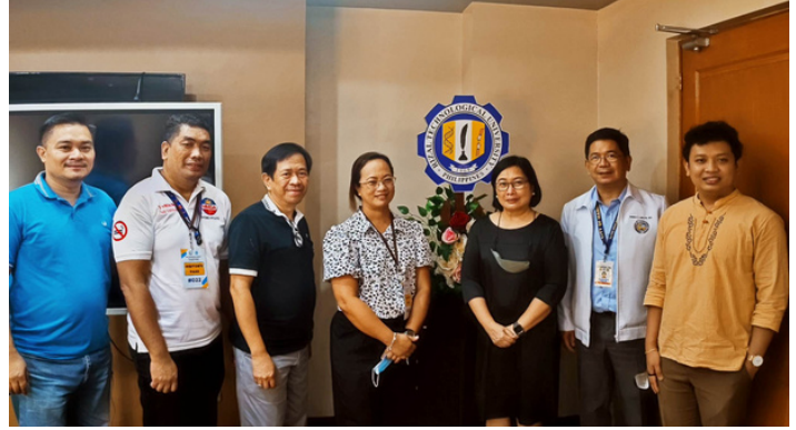
MMDA meeting with Mandaluyong's City Health Office and RTU

On 13 June, MMDA, Mandaluyong's City Health Office, and Rizal Technological University (RTU) representatives collaborated on a Compliance Study for Mandaluyong's Smoke-Free Ordinance. The goal is to help the city evaluate policy enforcement effectiveness and enhance health protection for residents. Attendees included RTU's President and Research Faculty, Mandaluyong's City Health Officer, Tobacco Control Program Team, and MMDA's Smoke-Free Environment Project team. Discussions centered on the significance of conducting a policy compliance study and how it will be advantageous to the city's Smoke-Free Task Force.