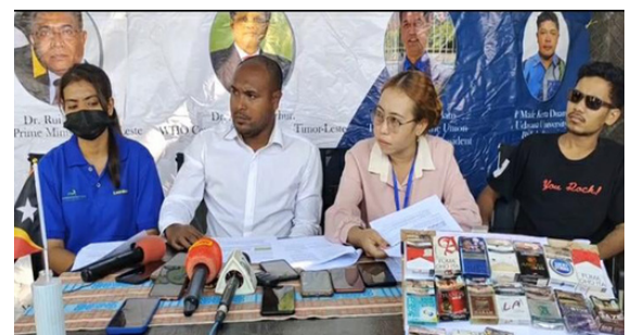
Press Conference on monitoring of illicit cigarettes

ANCT organized a press conference to unveil the findings of their monitoring of the prevalence of illicit cigarettes being sold in the country. The primary objective was to urge enforcement agencies and the government to promptly enforce tobacco laws. The press conference received extensive coverage, being broadcasted by six local media outlets, including Timor-Leste National TV and three other local media channels. As a result of this initiative, enforcement agencies conducted inspections nationwide, resulting in the confiscation of illicit cigarettes and the imposition of fines.