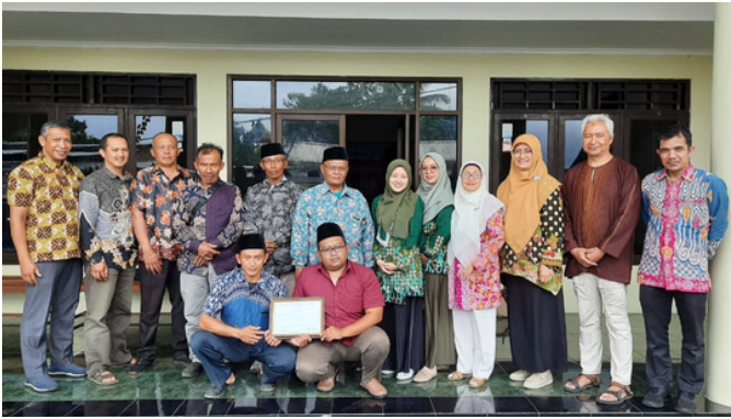
Press Conference conducted at Muhammadiyah University of Magelang

The Muhammadiyah Tobacco Control Support Centre at the University of Magelang organized a press conference with former tobacco farmers. These farmers from Magelang and Temanggung Regencies opposed the Omnibus Law on Health Draft due to insufficient involvement of stakeholders, particularly tobacco farmers, and the removal of important tobacco control measures, such as regulations on tobacco advertising, promotion and sponsorship. Nonetheless, they supported the government's effort to deter future generations from smoking.