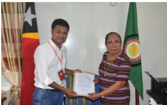
Meeting with new members of Parliament