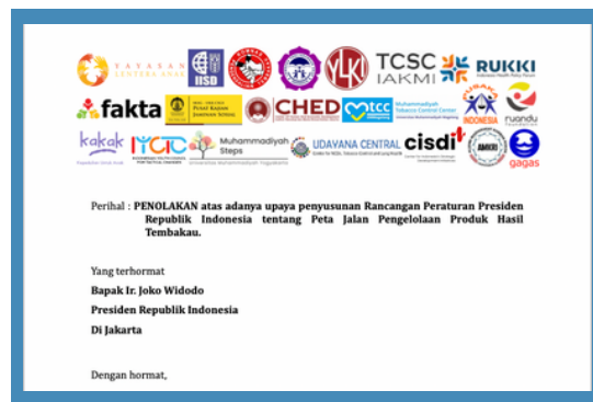
Letter to President: 20 organizations Rejects on Draft Presidential Regulation on Tobacco Products

Letters expressing opposition to the Tobacco Industry Roadmap were collectively dispatched by a coalition of 20 civil society groups to the Indonesian President, the Coordinating Ministry for Economic Affairs, the Coordinating Ministry for Human Development and Culture, the Ministry of Industry, the Ministry of Manpower, the Ministry of Health, the Ministry of Women's Empowerment and Child Protection, Bappenas, and the State Secretariat. A total of 16 articles were generated regarding this rejection letter sent to the President.