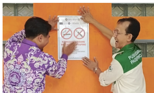
No Smoking Signage installation in Pagerwojo, Tulungagung

Pontianak: A capacity building session was conducted to enhance the expertise of 60 smoke-free inspectors, providing strong support for the implementation of smoke-free regulations. During the past two months, more than 1,200 "no smoking" signs were installed in Pontianak city.