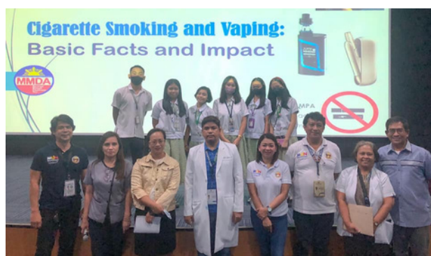
Muntinlupa City's Orientation on ENDS

As part of Muntinlupa City's No Smoking Month activities, an orientation on Electronic Nicotine Delivery Systems (ENDS) was held in Muntinlupa City. The orientation was attended by 57 high school students and teachers from different schools in the city. The main aim of the orientation was to educate the young adolescents about the harmful effects of vape-use and raise awareness about scientifically proven information concerning ENDS.