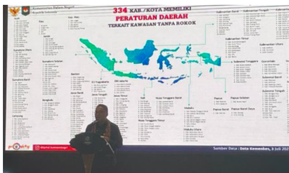
Virtual meeting on raising awareness about smoke-free policies

The Union's grantee, ADINKES, organized a virtual meeting with more than 3,000 participants from District Regulation Establishment Bodies (Bapemperda) across Indonesia. The meeting aimed to empower local governments about central policies for reducing smoking rates and promoting smoke-free policies. The initiative's ultimate goal is to declare three villages as smoke-free sub-districts in Palembang City. The meeting secured commitments from attendees to prioritize local tobacco control policies. The meeting was held in coordination with Ministry of Home affairs and engaged the head of Bapemperda.