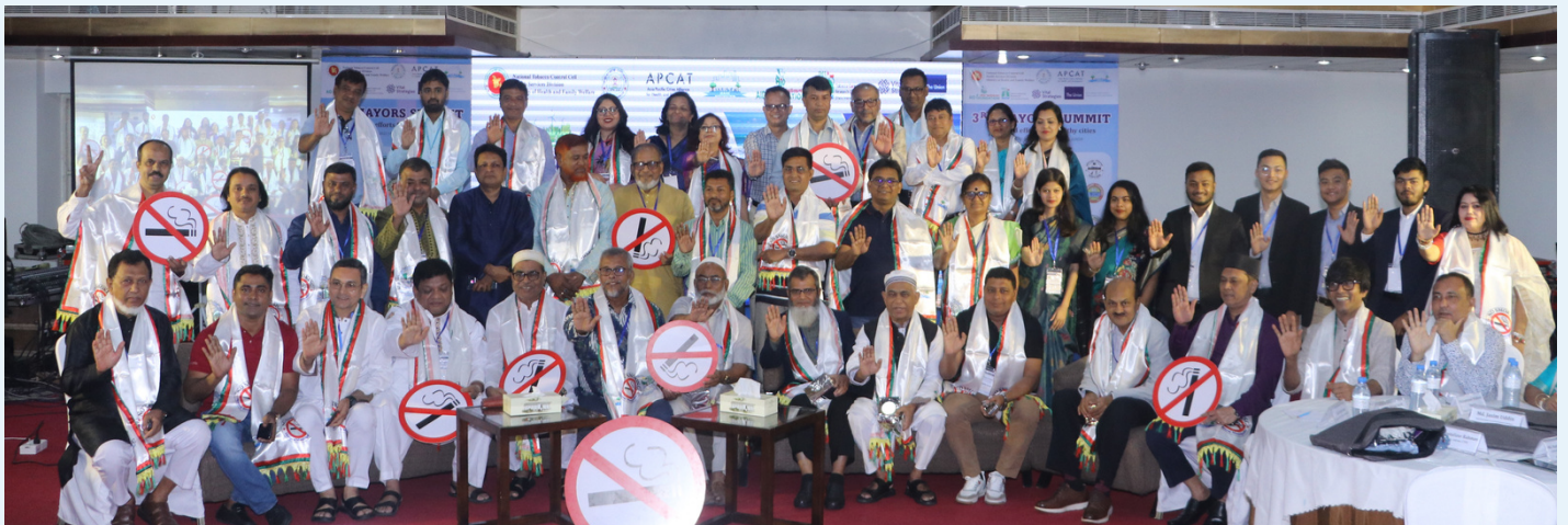
Group photo session with delegates of 3 rd Mayors' Summit of Bangladesh

The 3 rd Mayors' Summit of Bangladesh, themed "United Efforts for Healthy Cities," took place in Cox's Bazar, highlighting the significance of local actions in attaining global health objectives. Mayors from 30 municipalities convened to deliberate on strategies for enforcing tobacco control laws and local government guidelines. The summit focused on vital areas, including ensuring smoke-free public spaces and transportation, eradicating tobacco product advertisements, implementing compulsory licenses for tobacco sales, and allocating budgets for tobacco control initiatives.