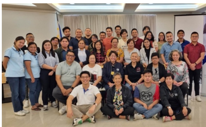
Smoke-free/vape-free ordinance communications strategy workshop

MMDA (Metropolitan Manila Development Authority) personnel inspected 173 schools and 32 public transportation terminals in the region to assess the sale of tobacco/vapor products, compliance with TAPS regulations, and proper display of No Smoking signage. A total of 1,769 violations were reported to the respective Local Government Units for verification and appropriate action.