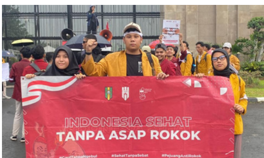
Rally outside of parliament to demand actions against Omnibus Bill

On 7 July, The Union grantee, Muhammadiyah Student Association, Smoke-free Jakarta and Indonesian Child Protection Agency (LPAI), alongside 20 health student community organizations, civil society organizations, and various youth organizations, collectively rallied outside the parliamentary premises to demand action against the Omnibus Bill.