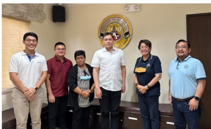
Meeting with Mayor of Balanga City

The Union, Ateneo School of Government, and Campaign for Tobacco Free Kids organized a workshop on smoke-free/vape-free ordinance communication strategies in Balanga City, Bataan, from June 20 to 23, 2023. The workshop aimed to develop a successful communications and research plan to effectively implement these regulations. They also met with Balanga City Mayor Hon. Francis Anthony Garcia, Co-Chair of the Asia Pacific Cities Alliance for Health and Development (APCAT), to discuss tobacco control strategies for 2023 to 2024.