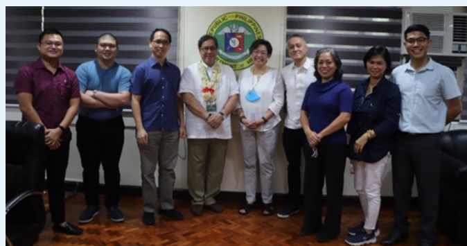
Meeting with Secretary of Health