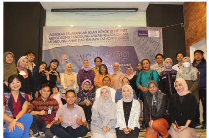
Participants of TAPS Ban workshop organized by Raya Indonesia

Raya Indonesia conducted a workshop to share the findings of their survey on "Tobacco Advertising Ban Advocacy on the Internet." The workshop involved officials from both the Ministry of Health and the Ministry of Communication and Information. The Ministry of Communication and Information's Public Relations department acknowledged the results of the survey on monitoring tobacco advertising and forwarded to the minister to identify strategies to reduce or ban tobacco advertising on the internet