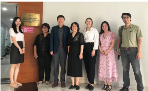
The Director of the Tobacco Control Department met with various stakeholders for tobacco cessation efforts in Vietnam