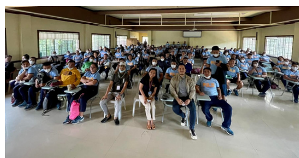
Smoke-Free Orientation at PNP CARTC

In Baguio City, on May 9, 2023, a Smoke-Free Orientation was successfully held at the Philippine National Police Cordillera Administrative Region Training Center (PNP CARTC), in collaboration with Smoke-Free Baguio and Benguet. The orientation targeted approximately 300 police trainees and aimed to provide them with crucial information regarding the Smoke-Free Baguio Ordinance, recent enforcement updates, the Smoke-Free Program, and the detrimental effects of smoking, vaping, and betel quid/momma consumption. PNP CARTC expressed its unwavering support for the implementation of the Smoke-Free Program, highlighting their commitment to promoting a smoke-free environment. This initiative demonstrates the collaborative efforts of Smoke-Free Baguio, Benguet, and the PNP CARTC in creating awareness, fostering compliance, and safeguarding public health.