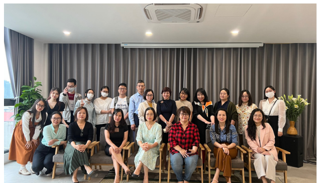
Participants of 3rd seminar organized by CCIHP

On 23th May 2023 The Union supported Vietnam Tobacco Control Fund (VNTCF) to work with the Central Propaganda Committee to conduct a briefing for news manager on the harm of new tobacco products and MOH position to ban it. MOH and Ministry of Trade and Industry have opposite views on this matter and the Union media monitoring shows that Tobacco Industry have used media to convey incorrect information to people.