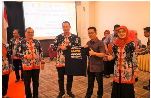
Advocay meeting on TC implementation in Balikpapan

To conduct advocacy for the tuberculosis (TB) program and enhance the implementation of the tobacco control (TC) program, a collaborative visit by the All Indonesia Public Health Services Association (ADINKES) took place in Balikpapan. The meeting was conducted on May 14 and attended by the East Borneo Secretary of the Province (representing the Governor), the Mayor of Balikpapan, the Head of the Subnational Health Authority, representatives from six districts/cities, and section heads of disease control from seven Dinas Kesehatan offices. A total of 37 participants joined the meeting. The primary objective of the meeting was to strengthen the relationship between TB, growth stunting, and smoking, emphasizing the critical importance of implementing comprehensive tobacco control regulations. Moreover, ADINKES also convened a meeting with officials from Ministry of Health, Head of Villages and community on May 15, to broaden the implementation of tobacco control initiatives at the village level of Balikpapan City. These efforts aim to create a healthier and more prosperous future for the people of Balikpapan.