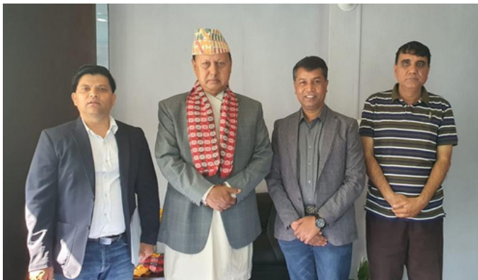
Meeting with Minister of Health and Population

Dr. Tara Singh Bam, Director of UAP Asia Pacific, and Mr. Ananda Bahadur Chand, Chairperson of Action Nepal, held a meeting with Hon. Mohan Bahadur Basnet, the Minister of Health and Population, to discuss the implementation of 90% pictorial health warnings and the imperative of raising tobacco product taxes in Nepal. During the meeting, compelling data was presented, revealing that Nepal possesses the lowest tax rates on tobacco products among South Asian countries, necessitating an increase in line with recommendations from the World Health Organization (WHO) and the World Bank. They also suggested that raising tobacco taxes would not only generate revenue for the government but also discourage people from smoking and alleviate the burden of tobacco-related diseases.