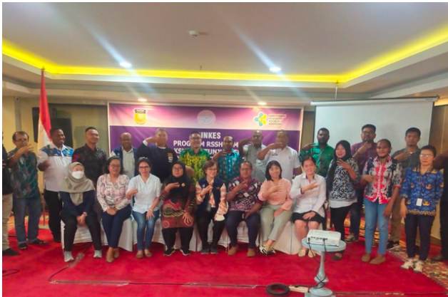
ADINKES meeting on development of TC Local Act in Tanah Papua

As a move towards combating tuberculosis (TB) and enhancing tobacco control efforts, ADINKES held a pivotal meeting in Tanah Papua. The gathering aimed to advocate for the development of a Tobacco Control (TC) Local Act while focusing on TB-related issues. Attended by 21 individuals representing six districts/cities, this collaborative effort sought to strengthen the correlation between TB and smoking, emphasizing the urgent need for enacting robust tobacco control regulations. ADINKES also met with the Head of Dinkes and Head of the Law Bureau in Papua to facilitate a provincial meeting dedicated to the development of comprehensive Tobacco Regulations. The visit to Tanah Papua by ADINKES underscores the commitment to fostering a healthier future and promoting the well-being of the local community.