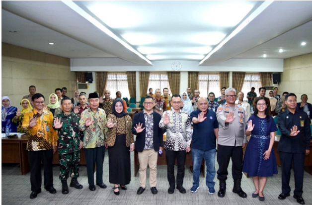
Meeting with the Mayor of Pontianak City

In commemoration of World No Tobacco Day, a high-level meeting was convened with the Mayor of Pontianak City. Esteemed leaders from government agencies, stakeholders, and hospitality sector associations graced the occasion. The Mayor emphasized the importance of safeguarding the public from tobacco smoke, urging all participants to join forces in bolstering the implementation of smoke-free initiatives throughout the city. During a one-to-one meeting with the Mayor, his unwavering commitment to advancing tobacco control regulations, including the prohibition of tobacco advertising, was evident, reflecting his steadfast dedication to attaining a higher level of health-conscious and child-friendly urban environment.