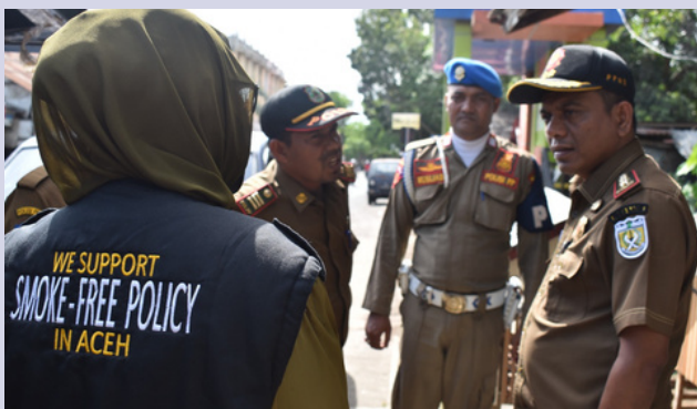
Enforcement drive conducted in Banda Aceh city during May

Banda Aceh City conducted two random inspections led by the Civil Police. 57 retailers were found to be in violation of TAPS (Tobacco Advertising, Promotion, and Sponsorship) policies. A total of 164 tobacco advertisements were removed as a result of these inspections. By conducting these inspections and taking action against violators, Banda Aceh City is demonstrating its commitment to enforcing TAPS policies and ensuring compliance within the retail sector. Such efforts can contribute to creating a healthier environment and reducing the prevalence of tobacco use within the community.