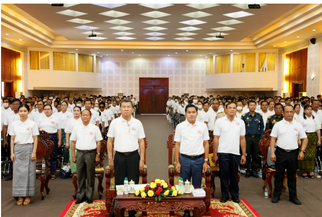
World No Tobacco Day Campaign in Kampong Cham

Kampong Cham: The second campaign was conducted at Kampong Cham province on 31 May 2023. About 500 participants from relevant departments, municipalities, districts, , students, youths and community joined the commemoration of World No Tobacco Day.