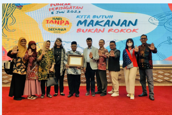
World Health Organization presented the World No Tobacco Day 2023 Award to Indonesia Multicultural Farmers Forum

Magelang Regency, Central Java is a major producer of tobacco. The Union together with Muhammadiyah Tobacco Control Support Centre, The University of Magelang (MTCC UMM) are working with farmers in Central Java to create mitigation solutions for tobacco farmers and counter industry messages about farming.