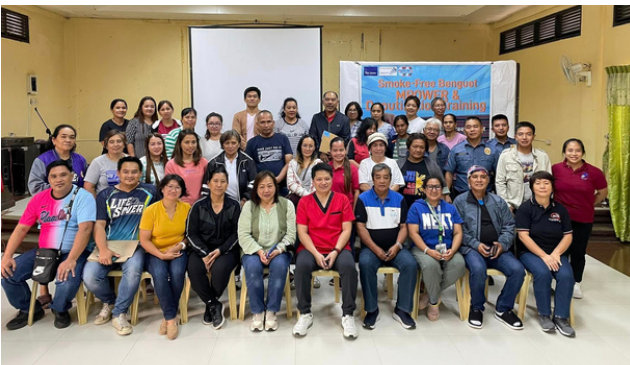
MPOWER and Deputation Training in Benguet