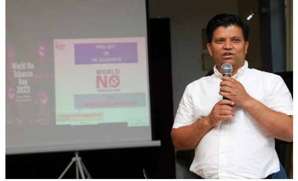
Snapshot from Press meet on WNTD 2023

On May 31 2023, The Union's grantee Action Nepal organized a press conference in Bijulibazar, Kathmandu, in honor of World No Tobacco Day 2023. With the theme "Grow Food, Not Tobacco," the event aimed to raise awareness about the detrimental consequences of tobacco consumption, encourage individuals to quit smoking, and foster discussions about the current state of tobacco taxation in Nepal. Distinguished representatives from various media outlets attended the press meet. During the conference, significant emphasis was placed on the urgent necessity for Nepal to raise tobacco tax rates, considering the public health crisis stemming from tobacco usage. It was emphasized that the government should prioritize public health and alleviate the burden of tobacco-related illnesses on the population. Additionally, raising awareness about the harmful effects of tobacco use and promoting sustainable livelihoods that do not depend on tobacco cultivation were deemed essential. A total of 27 journalists from diverse media houses actively participated in the program.