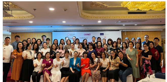
Consultation workshop on findings from community monitoring on the implementation of TC Law in 28 schools

On 24 May 2023, Center for Creative Initiatives in Health and Population (CCIHP) organized a consultation workshop with representatives from 28 schools participating in the monitoring on the implementation of Tobacco Control (TC) Law. The survey found that while understanding on tobacco harms is high, children in 28 schools are still exposed to tobacco through their friends, teachers, workers or parents smoking in and near school premises. There are still violations in schools regarding TC Law and most common violations are the lack of no-smoking signages in schools or TAPS ban violations at point-of-sale near schools. CCIHP works with schools to plan actions to improve compliance to TC Law.