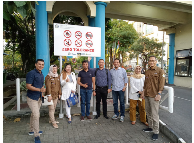
The Union team and its partners at Airlangga University

Airlangga University in Surabaya, Indonesia, has implemented a tobacco-free campus policy, which not only prohibits smoking, vaping, and the sale of tobacco products on campus but also includes a comprehensive ban on advertising, promotion, and sponsorship from harmful industries, including the tobacco industry. The university also now prohibits industry donations, direct or indirect engagements. With 35,000 students and 10,000 faculty and staff, the university aims to protect their well-being from tobacco-related harms. The university has installed no smoking signs and established an enforcement team to ensure compliance. Despite being located in a tobacco-producing region, the university has taken a stand against prevailing norms. Airlangga's achievement is commendable, as no other cities in East Java have implemented similar comprehensive bans. The Union has been collaborating with the Public Health Faculty of Airlangga University since 2008 to accelerate tobacco control in Surabaya and the surrounding region. This partnership has contributed to the university's dedication to make it tobacco-free.