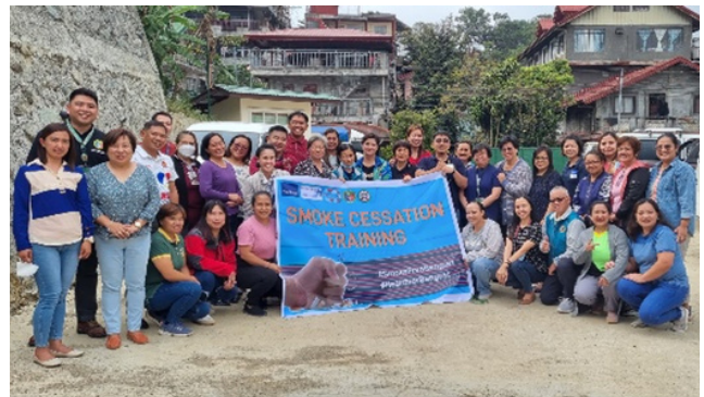
Smoking Cessation Training in La Trinidad