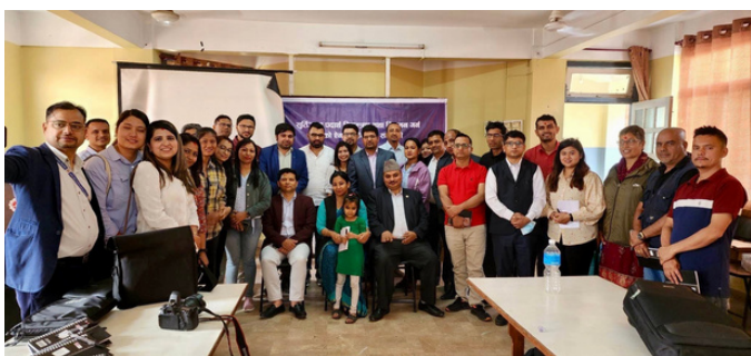
Snapshot from Program for sustainable tobacco control in Bharatpur Metropolitan city

In a collaborative effort, The Union's grantee Action Nepal joined forces with the Health Journalist Forum Nepal, Bharatpur Metropolitan City, and the Industry Association of Chiwan to organize a program focused on sustainable tobacco control in Bharatpur Metropolitan City. The program aimed to achieve several key objectives, including reducing the prevalence of tobacco use in Bharatpur Metropolitan City, increasing awareness about the harmful effects of tobacco use, promoting healthier lifestyles among residents, enforcing tobacco control laws and regulations, and ensuring the sustainability of a smoke-free Bharatpur Metropolitan City. The program received participation from notable figures, including the Mayor of Bharatpur Metropolitan City, underscoring the significance of the initiative in fostering positive change and promoting a tobacco-free environment.