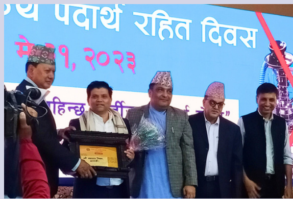
Action Nepal awarded with "Health Minister Bloomberg award 2023"