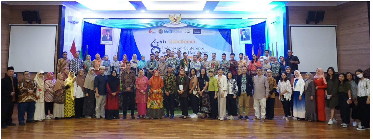
8 th Indonesian Conference on Tobacco or Health 2023

The 8 th Indonesia Conference on Tobacco or Health (ICTOH) under the theme "We need food, not tobacco" was conducted from 29 May to 1 May 2023. The conference gathered government representatives, civil society organizations, farmers, media, and youth to strengthen the tobacco control agenda at national and subnational levels. With an average daily attendance of 1,000 participants, the three-day program facilitated meaningful discussions and collaboration. Key ministries and mayors' involvement demonstrated a strong commitment to tobacco control. The conference aimed to raise awareness, promote policies, and foster multi-sectoral strategies to reduce tobacco consumption. The theme emphasized prioritizing food security and agricultural development over tobacco production. Overall, the 8 th ICTOH played a vital role in sustaining enthusiasm for tobacco control in Indonesia and promoting collaboration across sectors.