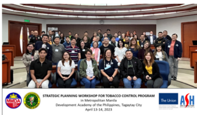
Strategic Planning Workshop for Tobacco Control Program

In April, the Metropolitan Manila Development Authority (MMDA) collaborated with the Department of Health Metro Manila Center for Health Development to organize a Strategic Planning Workshop for the Tobacco Control Program in Metro Manila. The objective of the workshop is to align the Tobacco Control program of Local Government Units (LGUs) with the National Tobacco Control Program (NTCP) Strategies 2023-2030. The workshop was participated by a total of 57 representatives from the 16 Metro Manila LGUs and partner agencies. During the session, the LGUs formulated their activities for the years 2023-2024, based on their approved Local Investment Plan for Health (LIPH) and Annual Operations Plan. In order to ensure comprehensive support for all NTCP strategies, a follow-up meeting is scheduled for August to draft the LIPH for the next term (2025-2028).