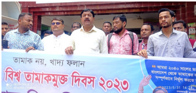
Cox's Bazar Municipality