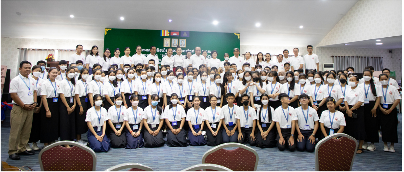
World No Tobacco Day Campaign in Phnom Penh

The National Centre for Health Promotion (NCHP), Ministry of Health (MoH) organized two separate campaigns for World No Tobacco Day 2023 under the theme “We need food, not tobacco.” The objectives of the campaigns are to: