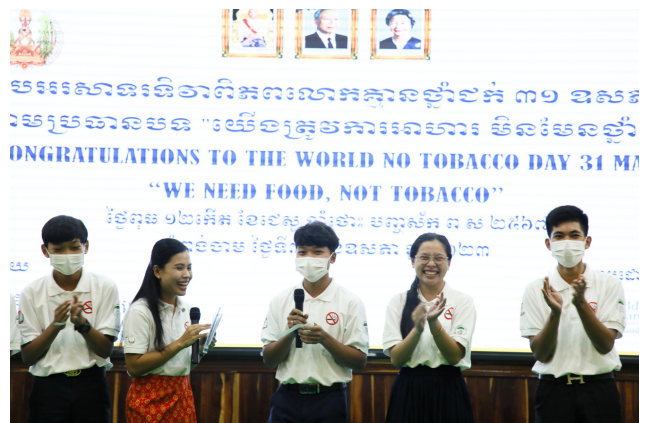
Quiz Game Session