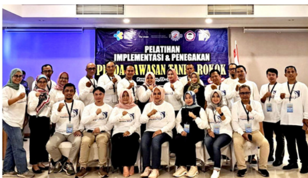
Comprehensive Tobacco Control Implementation training in Pangandaran

The Union grantee, No Tobacco Community, conducted comprehensive training sessions on the implementation and enforcement of tobacco Advertising, promotion, and sponsorship (TAPS), point of sale, and smoke-free policies at Pangandaran District, West Java on 23-24 May 2023. This hybrid meeting brought together 165 participants from various departments of six jurisdictions. The training also included a practical experience of random inspection around the city for those attended in person.