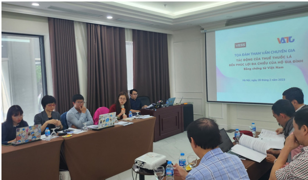
VATJ 1st consultation workshop in February

On 26 May 2023, the Vietnam Center for Economic and Strategic Studies (VESS) and Vietnam Alliance for Tax Justice (VATJ) organized 2nd consultation workshop on the "study on impact of tobacco tax on households' multi-dimensional welfare: evidence from Viet Nam". This is the follow-up workshop after the 1st consultation in February. The study was conducted with technical support from the Union with an aim to provide evidence for advocacy for tobacco tax raise. The study used data from the Viet Nam Household Living Standard Survey in 2012-2020 and found that there is a correlation between smoking and multi-dimensional welfare indicators of households. The increase of tobacco tax would lead to less consumption and hence leading to improving welfare for household's members. The Union will continue to support VESS and VATJ to formulate advocacy messages based on study findings.