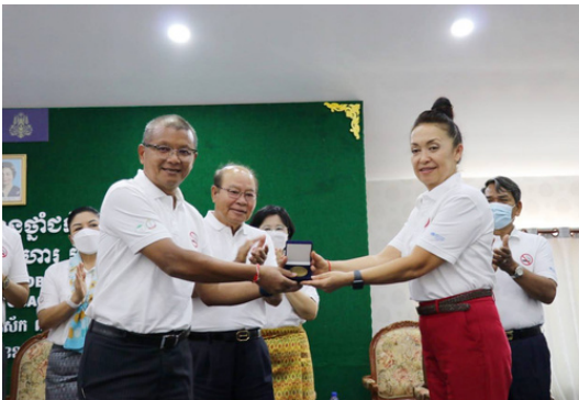
Dr. Hang Chon Naron, Minister of Education, Youth and Sport of Cambodia, accepted the World No Tobacco Day Award

Phnom Penh: The first campaign was conducted at the Ministry of Health, Phnom Penh on 29 May 2023. Total 250 participants from the tobacco control committee, MoH officials, the rector of MoH University, the Director of the Department of National Centers and National Hospitals, WHO representative, development partners, university students and media joined the campaign. At there, WHO Director-General “World No Tobacco Day Award 2023” was presented to Ministry of Education, Youth and Sport - one of the four awardees from WHO Western Pacific Region.