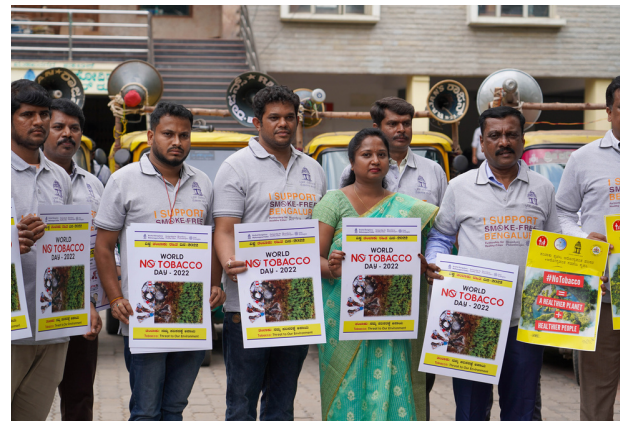
Tuk Tuk Campaign

To support the national cigarette & order tobacco products act 2018, Bengaluru has taken a bold decision to remove the designated smoking areas in all public places, therefore making these places truly smoke-free. The city became the first in India for such initiative. With the support of Special Commissioner, Health, Bruhath Bengaluru Mahanagara Palike (BBMP), Smoke-free Bengaluru Initiative conducted several activities, including roundtable discussions, public awareness campaigns and capacity building of enforcement officers, to strengthen the implementation of tobacco control law in the city with focused enforcement drives and worked on advocacy to regulate hookah bars/cafes, which has become a major issue in the city, especially around educational institutes.