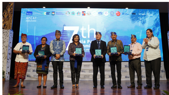
APCAT Award Winners 2022

WHO World No Tobacco Day 2022 Award winner: