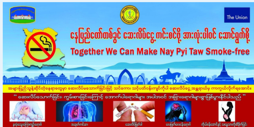
Awareness-raising Billboard erecting at central Nay Pyi Taw

Myanmar's capital city, Nay Pyi Taw has issued a decree extending the requirements specified by the country's national tobacco control law and making smoke-free legislation more comprehensive in the Nay Pyi Taw region. Smoking is now prohibited in hospitals, clinics, workplaces, children's playgrounds, education facilities and commercial accommodation. This city level decree, issued by the Nay Pyi Taw Development Committee (NPTDC), is the first of its kind in Myanmar, and is intended to close gaps and ensure effective implementation. The Ministry of Health is promoting the city's success to other states and regions in Myanmar.