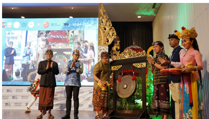
Opening ceremony of 7 th Asia Pacific Summit of Mayors

Over 500 delegates, including 48 mayors and vice-mayors, from 62 cities of 10 countries across the Asia Pacific region joined the Summit physically and virtually. More than 200 young people took part in 1st APCAT Tobacco Free Youth Festival that preceded the Summit to not only resolve to grow without tobacco, but also to foster leadership and accountability among the youth for advancing tobacco control. The Summit was jointly organised by APCAT, Ministry of Health, Indonesia; Ministry of Home Affairs, Indonesia; National Centre for Health Promotion, Ministry of Health, Cambodia; Bloomberg Philanthropies; cities of Bogor, Denpasar and Klungkung of Indonesia; Balanga City, Philippines; Association of All Health Offices Indonesia (ADINKES), Indonesia Mayor and Regent Alliance, Indonesian Public Health Association; Udayana Central; Campaign for Tobacco Free Kids, Vital Strategies; Tobacco Free Generation International; the International Union Against Tuberculosis and Lung Disease (The Union); APCAT Parliamentarians and APCAT Media.