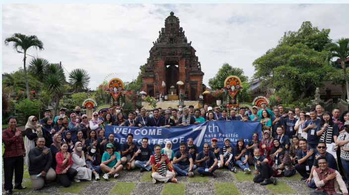
Site visit to Klungkung Regency to observe implementation of tobacco control