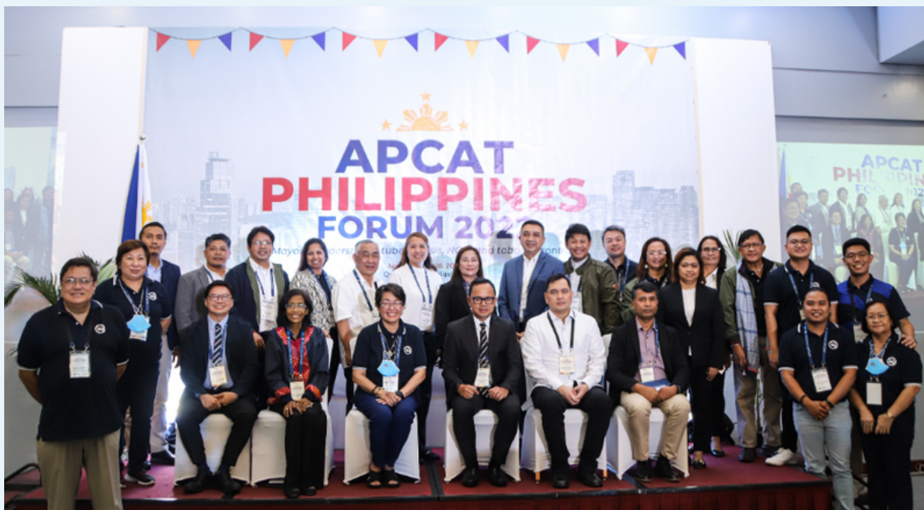
APCAT co-chairs and delegates at APCAT Philippines Forum 2022

The first APCAT Philippines Forum was conducted in Manila on 17 -18 November 2022. In this two-day hybrid forum, over 100 participants across the country participated from 20 cities, 12 civil society organisations, three international organisations, and six national and regional government agencies.