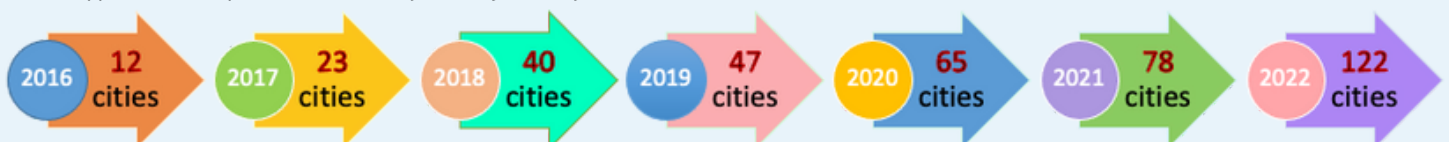
Evolution of the APCAT since its establishment