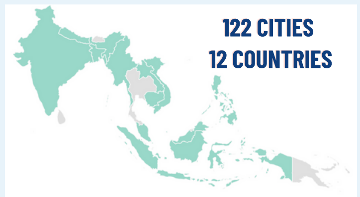
APCAT countries in Asia Pacific Region

The goal of the APCAT is to ensure a whole-of-government approach in offering health solutions through building stronger political commitments, new partnership opportunities, sustainable and effective use of resources and stronger health system performance and outcomes. APCAT also aims to accelerate progress towards eventually ending tobacco use, as well as preventing the avoidable burden of non-communicable diseases (NCDs), eliminating tuberculosis (TB) and viral hepatitis, and improving synergy between health and development programmes and promoting integrated responses through One Health approach where possible, and thereby averting untimely deaths.