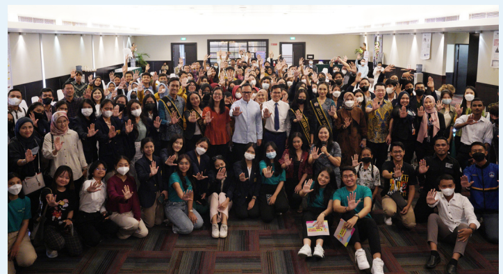
Participants of 1st APCAT Tobacco Free Youth Leader Festival