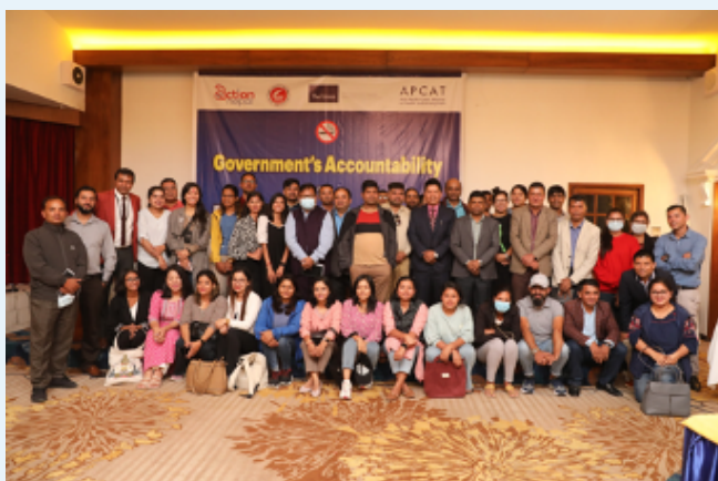
Participants of "Government's Accountability to Promote Tobacco Control in Nepal" programme

A multi-sectoral interaction programme entitled "Government's Accountability to Promote Tobacco Control in Nepal" was held in October 2022. Over 50 participants took part, including government officials, representatives from The Union and APCAT, tobacco control advocates, civil society and the media. The objectives of the programme were to identify actions and responsibilities and gain their commitment in responding to the burden of tobacco use in Nepal. The programme was jointly organised by Action Nepal, Health Journalist Forum Nepal, The Union, and APCAT.