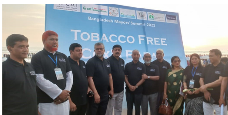
Bangladesh Mayors' Summit 2022

Mr Mujibur Rahman, Chairman of Mayor Alliance for Healthy City and Mayor of Cox's Bazar Municipality, met with the Honorable Prime Minister of Bangladesh, Sheikh Hasina, at Ganabhaban on October 24, 2022. Mayor Mujibur Rahman informed the Honorable Prime Ministers that the Mayor's Summit Bangladesh 2022 was held to build a healthy city with the goal of creating a tobacco-free Bangladesh by 2040. The Honorable Prime Minister applauded such initiatives and encouraged the continuation of the tobacco-free programme. She emphasised that as tobacco is extremely harmful to public health, elected public representatives from local government institutions must step forward and play a significant role in protecting public health in order to make the country tobacco-free.