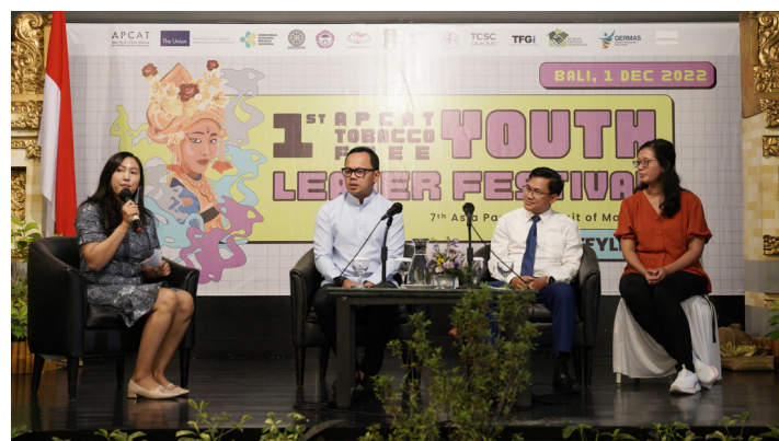
Talk-Show at 1st APCAT Tobacco Free Youth Leader Festival

This year, eight APCAT awards and one WHO World No Tobacco Day 2022 award were presented to outstanding cities, ministry and media for their achievements and leadership in integrating tobacco control within the government's plan, implementing smoke-free policy, banning of tobacco advertising, promotion and sale of single stick cigarettes, licensing tobacco vendors and countering tobacco industry interferences, thereby, safeguarding peoples' health.