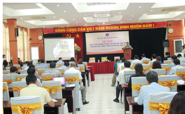
Policy workshop on tobacco control law enforcement

Vietnam Tobacco Control Fund coordinated a high-level policy workshop to build tobacco control capacity. Delegates shared their experience of inspecting and monitoring the implementation of tobacco control policies and discussed measures for strengthening enforcement. Best practices including integrating tobacco control within food safety inspections and applying technology to mobilise communities were shared. More than 100 delegates from ministries and provinces across the country participated, including representatives from the National Assembly's Social Committee and Office of the Government.