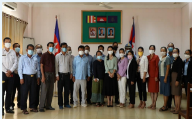
Capacity building training for Tobacco Control Inspection Officers at Phnom Penh, Ratanakiri, Prey Veng, Kampong Chhnang, Kampong Cham provinces

The Cambodian Alliance for Tobacco Control and NCD Prevention (CAT) was established in 2017 with the objective to make effective implementation of smoke-free, ban tobacco advertising, promotion and sponsorship, and identify local solutions for local problems. National Centre for Health Promotion, Ministry of Health, Cambodia in coordination with CAT and APCAT, held a virtual round table meeting to share lessons learnt, best practices, identify local problems and discuss appropriate solutions related to CAT cities in order to enforce implementation of tobacco control programmes, especially in the context of COVID-19. This summit engaged governors from 12 provinces to affirm commitments for adoption of tobacco control policies. CAT is now expanded to 16 provinces in Cambodia.