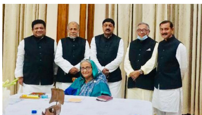
Meeting with the Honorable Prime Minister of the People's Republic of Bangladesh