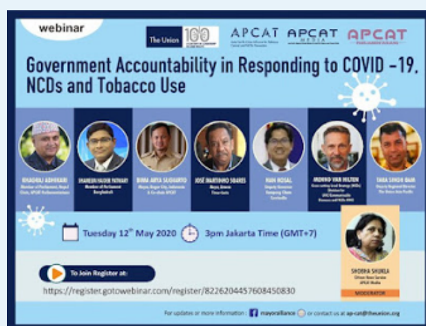
One of the webinars hosted by APCAT and APCAT Media during pandemic

In November 2022, APCAT Media was a lead organiser of the 2nd Annual Global Media Forum around World Antimicrobial Awareness Week 2022. APCAT Media hosted the forum with 16 other media organisations and national journalists associations in Asia Pacific and African region. Antimicrobial resistance experts WHO, UNEP, WOA, and FAO all attended the event.