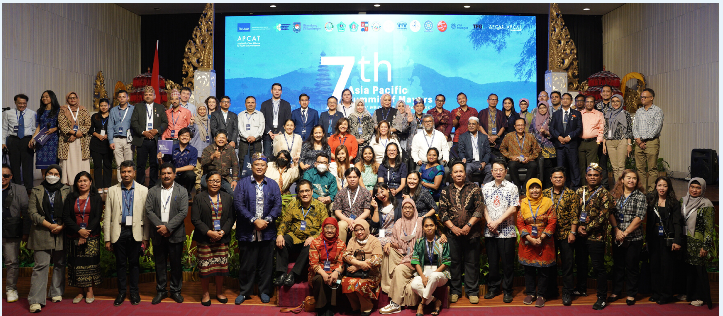
Participants at the 7th Asia Pacific Summit of Mayors, 1 - 3 December 2022 in Bali, Indonesia

Established in 2016, the Asia Pacific Cities Alliance for Health and Development (APCAT) is a unique alliance of mayors and sub-national leaders from 122 cities of 12 countries (Bangladesh, Cambodia, India, Indonesia, Lao PDR, Malaysia, Myanmar, Nepal, Philippines, Singapore, Timor-Leste and Vietnam) that work collectively to gain political commitments to offer local solutions to local problems. It believes that sub-national leaders' role is the key to bring change through good city-level governance. The Union Asia Pacific is a founder as well as secretariat of APCAT.