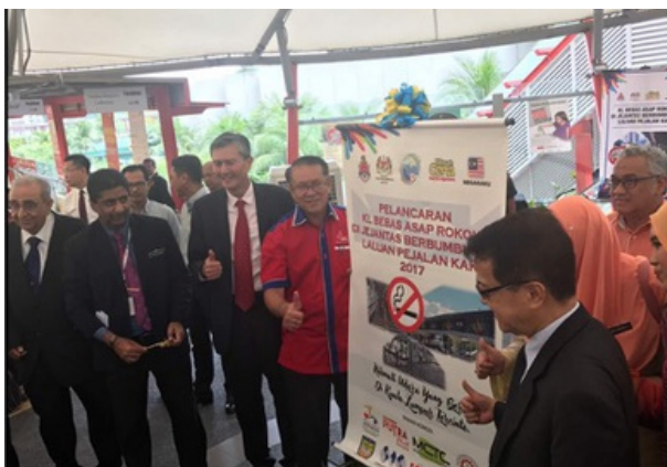
MOU Signing Ceremony for making smoke-free bridges and pedestrian walkways

Kuala Lumpur City Hall (DBKL) has started an initiative to reduce the prevalence of smoking and to educate non-smokers on the risks associated with second-hand smoke. DBKL has pledged to make Kuala Lumpur a smoke-free city by 2025 - an initiative towards Smoke-Free Kuala Lumpur or Kuala Lumpur Bebas Asap Rokok. DBKL is leading the change and has called on the Minister of Health for a strong smoke-free enforcement drive in Malaysia.