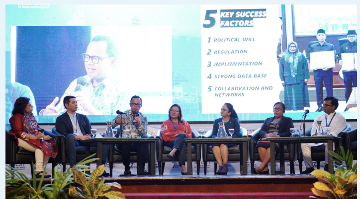
Panel discussions with mayors from across the Asia Pacific region