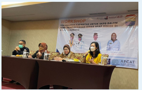
The Union staff sharing smoke-free enforcement best practice