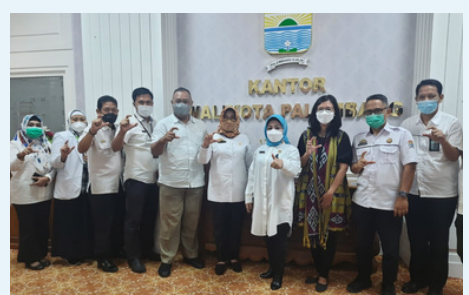
Meeting with Palembang Mayor Expert Staff for Economic and Development

The Union held a meeting with Palembang Mayor Expert Staff for Economic and Development along with the related agencies such as Health Office, Civil Police, Education Agency, Tourism Agency, and Governance Department to provide technical assistance and strategic guidance for smoke-free. The Union also trained 50 officials in smoke-free enforcement best practices.