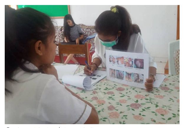
One to one interview during pre-testing

The Union grantee, National Alliance for tobacco control Timor-Leste (ANCT-TL), conducted a pre-testing for the survey on assessing the effectiveness of pictorial health warnings and to identify the most effective health warning for new rotation in Timor-Leste. The pre-testing was conducted in two Municipalities, namely Ermera and Manatuto.