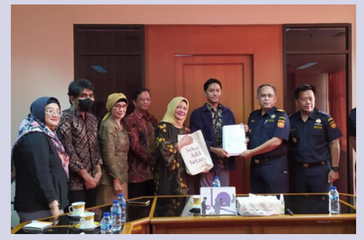
Meeting with the Director General of Custom and Excise

The Tobacco Control Network handed letters of support from Tobacco Control Organizations to the Director General of Customs and Excise to show the support on increasing excise tax for 2023 and to simplify the tax tier. The network also requested the Director General to support tobacco control by monitoring the use of excise stamps, as they are found covering the pictorial health warnings.