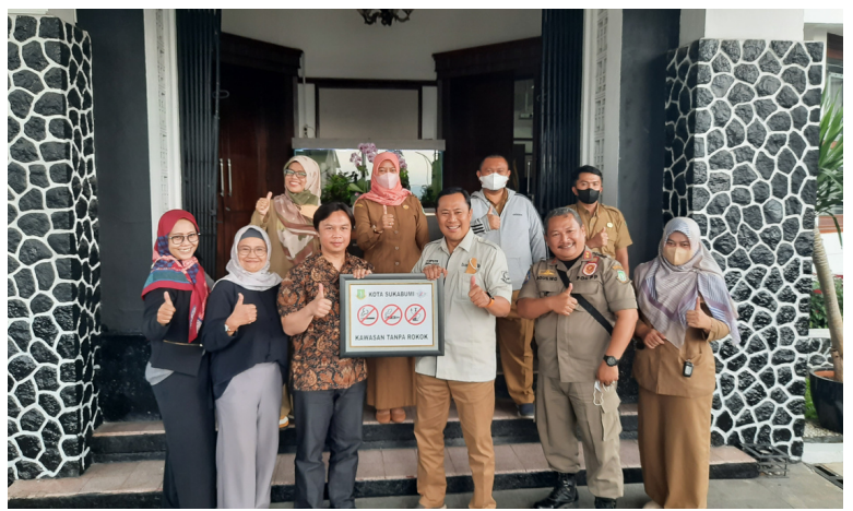
Meeting with Mayor of Sukabumi

No Tobacco Community, Bogor, had a meeting with Mayor of Sukabumi. The Mayor acknowledged the importance of smoke-free and tobacco advertising, promotion, and sponsorship (TAPS) ban. The Mayor also agreed to implement smoke-free areas, point of sale display ban and TAPS ban. The Mayor has endorsed the establishment of a smoke-free task force and issued a circular letter on the implementation and enforcement smoke-free.