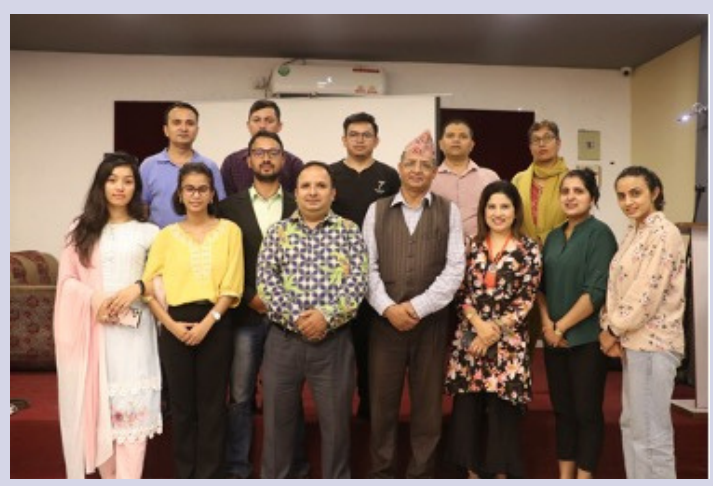
Chief editors and health journalists attending the press meeting

Action Nepal held a press meet with chief editors and health journalists from online and print media. Action Nepal shared the mandate for the effective implementation of 90% Pictorial Health Warnings on tobacco packs. Tobacco companies' interventions and tactics to delay the implementation of the law were shared, and Action Nepal's lawyer talked about the overall litigation process from filing to winning the case.