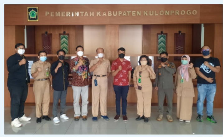
Meeting with Kulon Progo Regency

The Union team met with the Kulon Progo Regency to renew commitments for tobacco control. The Union also met with SEMARKU a unique organisation consisting of youth volunteers, civil police and local health officers that drive tobacco control efforts in the city. Such collaboration between sectors and all levels of community is an excellent example for other regions to synergize smoke-free implementation and enforcement.