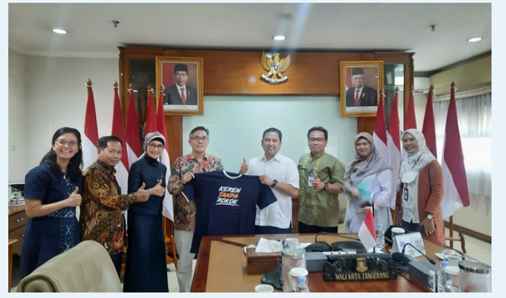
Meeting with Mayor of Tangerang