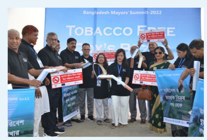
Bangladesh Mayors' Summit 2022

The Mayor Alliance for Healthy Cities, Cox's Bazar Municipality, Dhamrai Municipality, Tobacco Control and Research Cell of Dhaka International University and Aid Foundation jointly arranged the event, with the technical support of The Union and Asia Pacific Cities Alliance for Health and Development (APCAT).