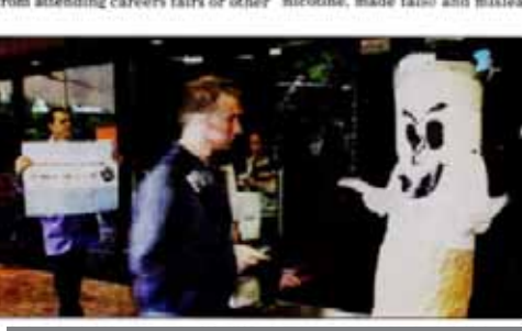
Illawarra Mercury report, 6 April 2004