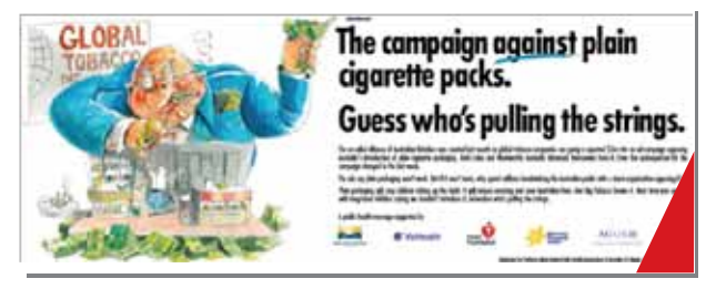
Health groups' counter-ad in Australian press, August 2010

The AAR campaign split the retailer groups, with major supermarkets Coles and Woolworths repudiating the campaign and the Australian Association of Convenience Stores withdrawing from it. Meanwhile health groups launched a counter-campaign under the banner "Guess who's pulling the strings?"