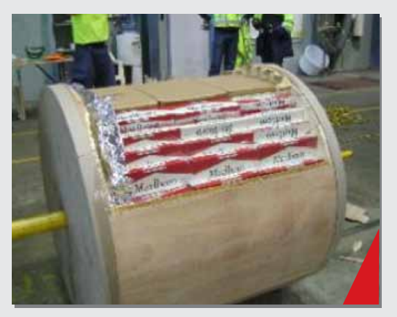
Beating up the black market

Illicit tobacco haul